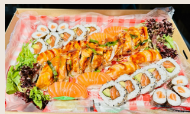
Assorted Sushi Platter

Salmon, Aburi Salmon, avocado, cucumber and or crab on assorted nori