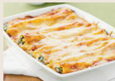
Spinach and Ricotta Cannelloni