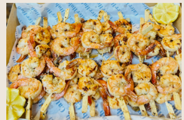
Garlic Prawn Skewers