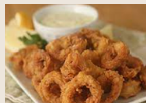
Calamari Bite with aioli