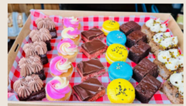
Dessert platter for share