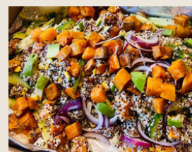
Sweet potato salad, cucumber, corn, quinoa, onion and cherry tomato