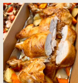
Herb roasted whole chicken with hearty oven baked vegetable