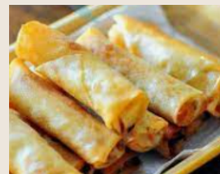
Peking Duck Spring Roll