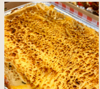
Homemade cheesy angus beef lasagne