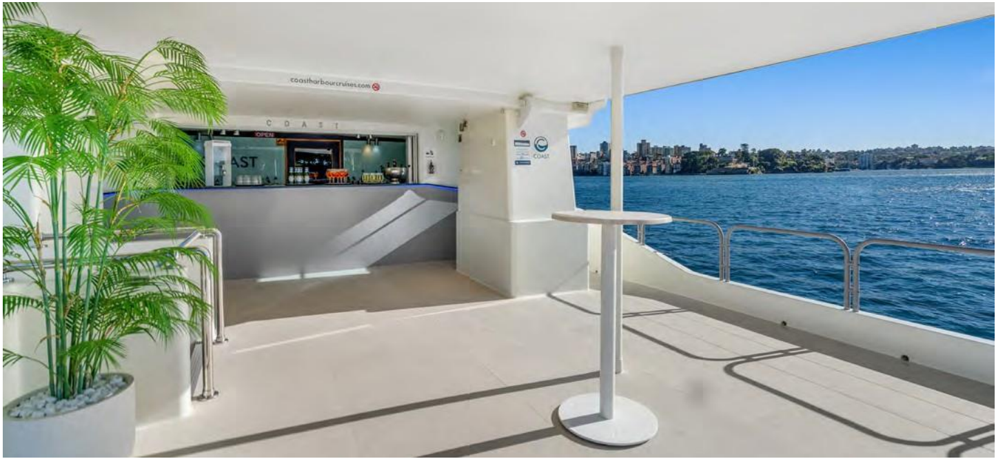
Upper deck aft