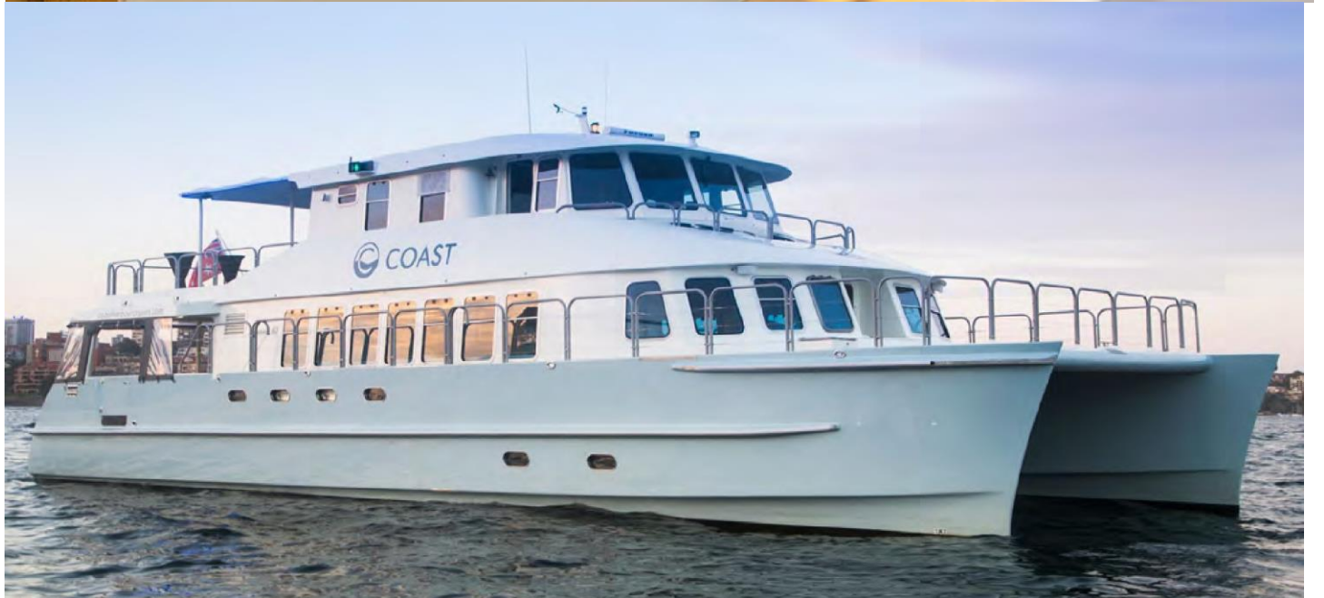
Lower deck interior